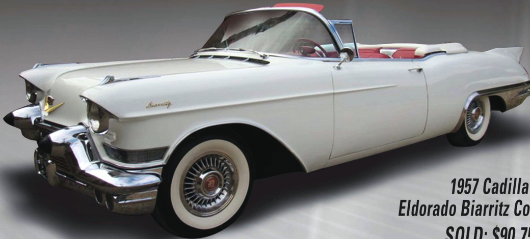
1957 Cadillac Eldorado Biarritz Convertible SOLD: $90,750