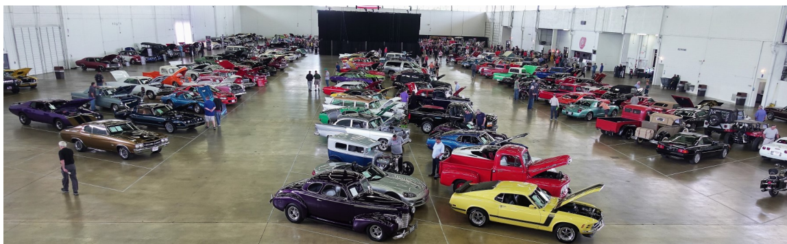
Here is just a portion of the almost 500 cars being auctioned this weekend.

The auction halls had more than just Cadillacs. There were cars of many years and many makes and all were highly shined up and ready for the auctioneer's hammer.