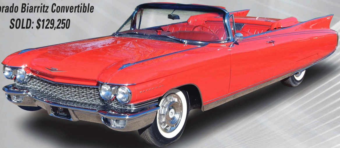
1960 Cadillac Eldorado Biarritz Convertible SOLD: $129,250

To Bid or Consign • LeakeCar.com • 918.254.7077